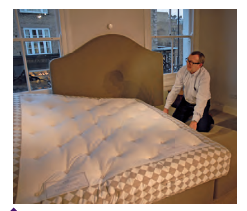
Pull the now turned mattress by the handles and slide it back into position.