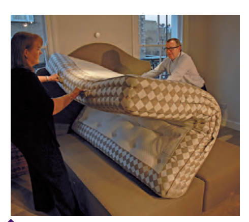
Push the mattress away from you.