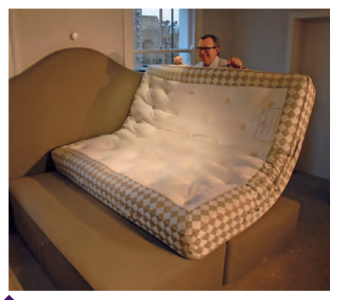
• Using the handles, lift the edge of the mattress.

Your Marshall & Stewart mattress is very heavy, so please do not attempt to turn it single handed and keep your back straight at all times.