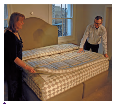
Place the topper on the bed.